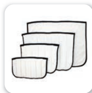
THERA-TEMP® MOIST HEAT WRAPS