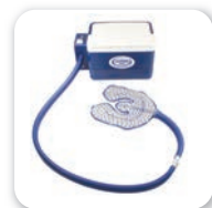
ACTIVE ICE® POST-SURGERY SYSTEM