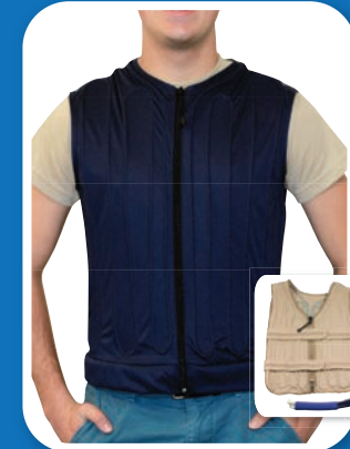
COOL FLOW® VESTS