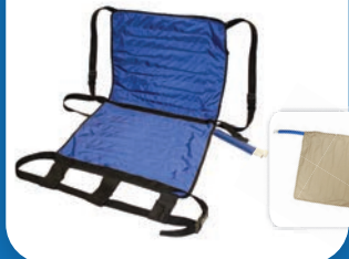
COOL FLOW® SEATS