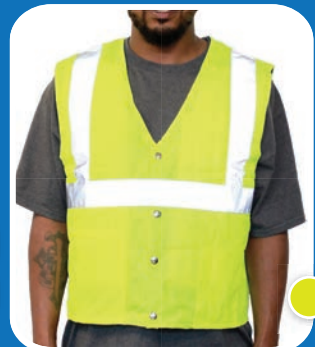
SAFETY COOLING VEST