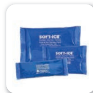
SOFT ICE® COLD/HOT PACKS

Visit www.polarproducts.com to see our complete hot & cold therapy product line.