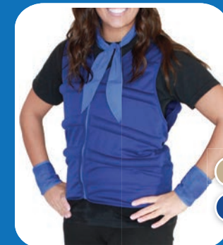
COOL COMFORT® KIT

Submerge in water to activate cooling. Offers evaporative cooling in low humidity. Gain additional cooling by chilling or freezing the garment.