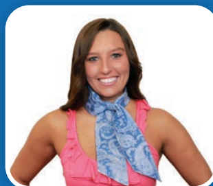
Fashion Cooling Scarves