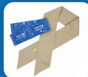
Deluxe Cooling Neck Tie