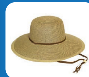
Cool Comfort® Hats