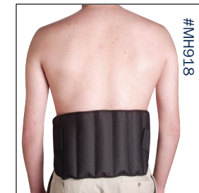
Back and Hip Wrap