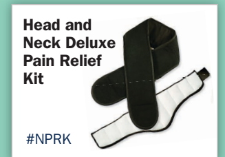
Head and Neck Deluxe Pain Relief Kit