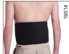
Back and Hip Wrap

Visit our website to see our complete line of targeted and universal compression wraps.