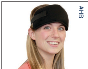
Head and Jaw