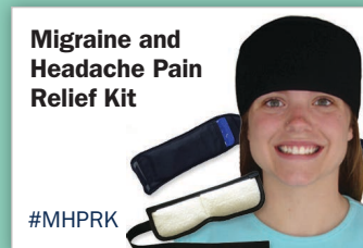
Migraine and Headache Pain Relief Kit

Save 10% when you purchase a therapy kit!