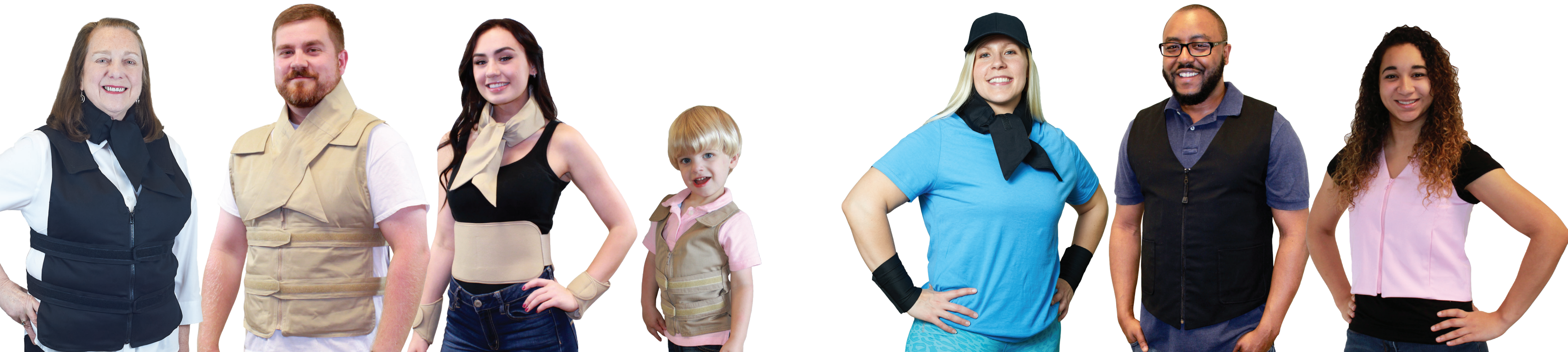
KOOL MAX® ZIPPER VEST AND NECK WRAP

For more information: Call MSF at 1.888.MSFOCUS (673.6287) or visit www.msfocus.org/Get-Help/MSF-Programs-Grants/Cooling-Program