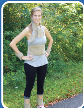
CoolFit® Kit with Secrets Torso Wrap