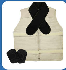
Zipper Vest Kit