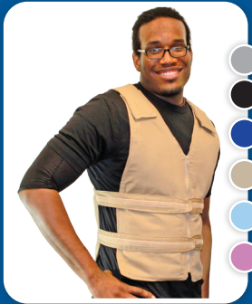
Zipper Front Vest

Adjustable sizes fit snug to the body for optimal cooling.