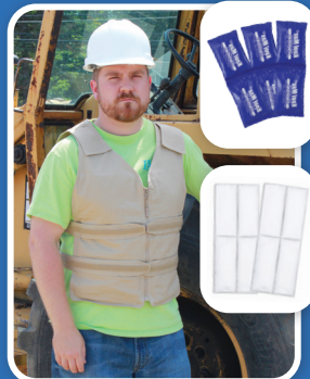
Industrial Vest Kit