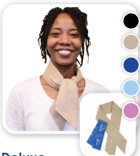
Deluxe Neck Wrap