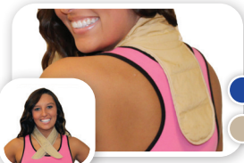
Neck & Spine Wrap