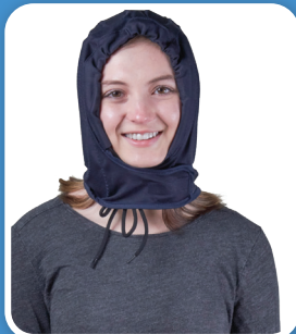
Head Cap Cooling System

Vests, head caps, wheelchair seats, multiple-person and custom circulating water systems available.