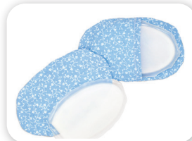
Cool58® Bra Coolers