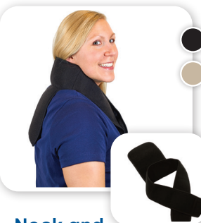
Neck and Upper Spine Wrap