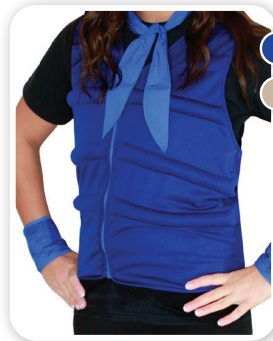
Performance Sports Vest Kit

Lightweight, water-activated cooling is ideal for exercise and outdoor activity.