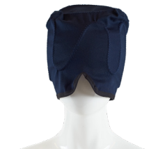
EXTENDED HEAD CAP (#HCL)