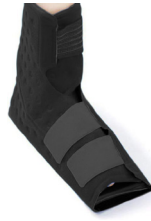
FOOT & ANKLE (#FBN)