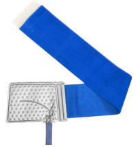
BACK & HIP (#LB)