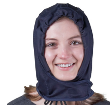
HEAD CAP (#HC)