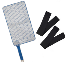
FULL CIRCUMFERENCE KNEE (#KBFULL)