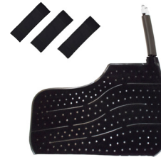
FOOT - LARGE (#FBLG)