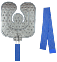
UNIVERSAL "U" (#UB)

It is okay to lay or sit on the therapy pads. Many people tuck the rectangular pad inside a pillowcase.