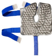
KNEE & JOINT (#KB)