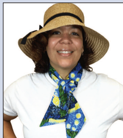
Fashion Cooling Scarves