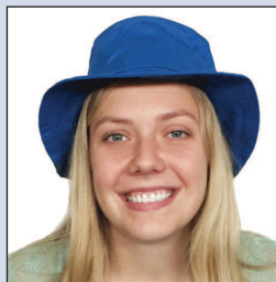
Deluxe Cooling Hats