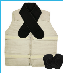
ZIPPER VEST KIT

Most of Polar's cooling kits come with an extra set of cooling packs for each item.