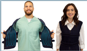
ADJUSTABLE VEST SYSTEM