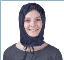
HEAD CAP SYSTEM

Vests, head caps, wheelchair seats, multiple-person and custom circulating water systems available.