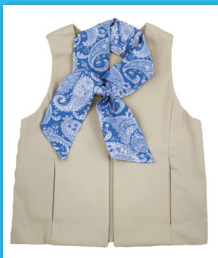
FASHION VEST KIT