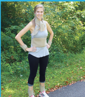
COOLFIT® KIT WITH SECRETS TORSO WRAP

We've bundled our most popular cooling vests and accessories into kits sold at a discounted price. Use the products separately as needed or together for maximum cooling.