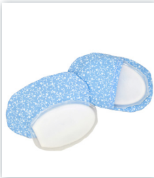
COOL58® BRA COOLERS