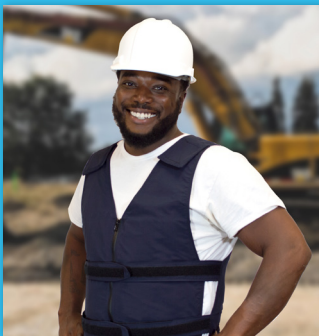
INDUSTRIAL VEST KIT