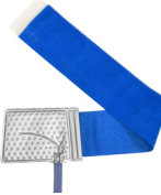
BACK & HIP (#LB)