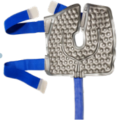
KNEE & JOINT (#KB)