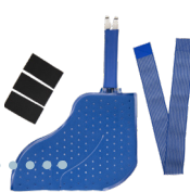
FOOT & ANKLE (#FB)