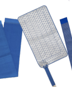
EXTENDED COVERAGE HIP (#HP)

"After my total hip replacement, this product was so helpful with my pain relief. I used the ice bottles so I didn't have to empty the cooler every day."