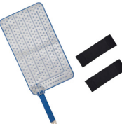
FULL CIRCUMFERENCE KNEE (#KBFULL)

"I had a total knee replacement and it's been so helpful. I have to say, this is a lifesaver – I love this product. I highly recommend this."