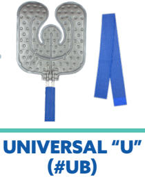
UNIVERSAL "U" (#UB)