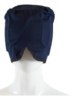
EXTENDED HEAD CAP (#HCL)

"I absolutely love this head cap and would recommend it to anyone suffering from frequent migraines."