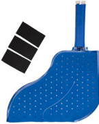
FOOT & ANKLE (#FB)

Read more customer reviews at polarproducts.com .