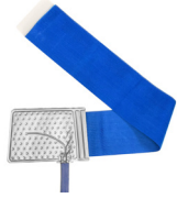
BACK & HIP (#LB)