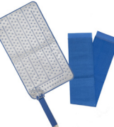
EXTENDED COVERAGE BACK (#RBFULL)