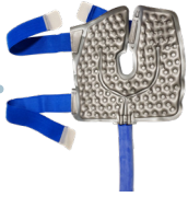
KNEE & JOINT (#KB)