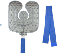
UNIVERSAL "U" (#UB)