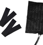
FULL CIRCUMFERENCE KNEE (#KBFULL)

"I had a total knee replacement and it's been so helpful. I have to say, this is a lifesaver – I love this product. I highly recommend this."