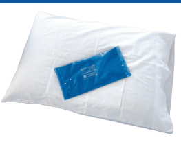
SOFT ICE® PILLOWCASE

See additional cost-saving kits at polarproducts.com .