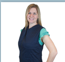
FITTED VEST SYSTEM