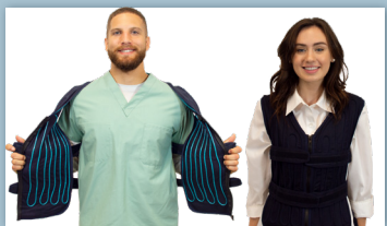
ADJUSTABLE VEST SYSTEM

Vests, wheelchair seats, multiple-person and custom circulating water systems available.