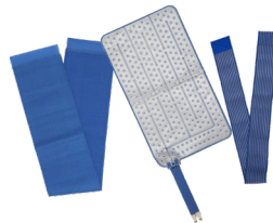
EXTENDED COVERAGE HIP (#HP)