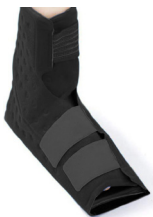
UPPER FOOT & ANKLE (#FBN)