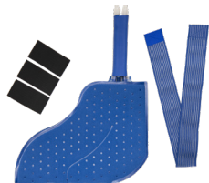
FULL COVERAGE FOOT & ANKLE (#FB)