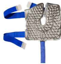
KNEE & JOINT (#KB)