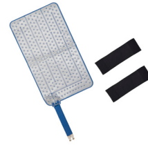
FULL CIRCUMFERENCE KNEE (#KBFULL)