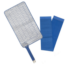
EXTENDED COVERAGE BACK (#RBFULL)