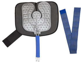
TARGETED COVERAGE SHOULDER (#UB+SAW)