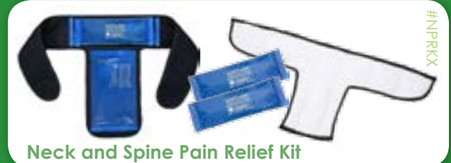
Neck and Spine Pain Relief Kit

Save 15% when you purchase a therapy kit!