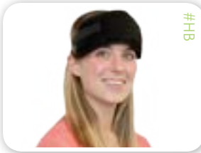
Head and Jaw