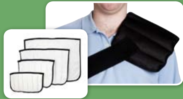
Target, Standard, King, XL Pad