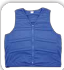
Deluxe Sports Vest

Unisex vest is lightweight for athletics and offers discreet cooling beneath clothes!