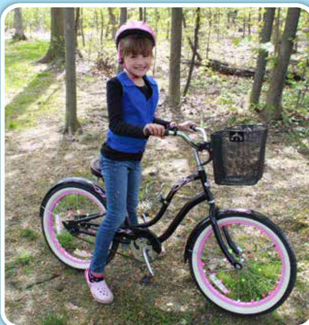
National Pediatric MS Center at Stony Brook University Medical Center. "Keeping Your Cool This Summer." Pediatric MS Newsletter (Summer 2011): 2. Print.

Our Cool58® technology cools at a comfortable and safe temperature of 58 degrees F and is effective in any climate.