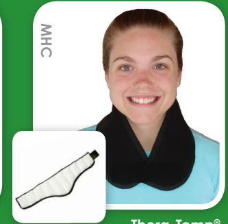
Thera-Temp® Cervical Wrap