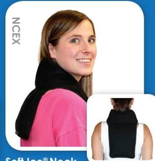
Soft Ice® Neck and Upper Spine Wrap