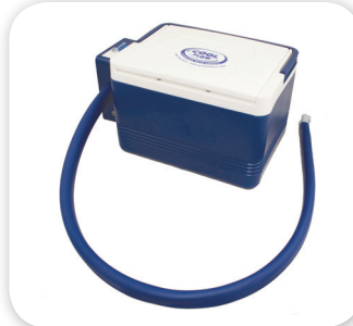
Cool Flow® System

The Cool Flow® Head Cap System provides the highest level of cold therapy!