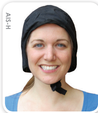
Cool Flow® Head Cap

The Cool Flow® Head Cap System provides the highest level of cold therapy!