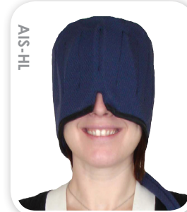
Cool Flow® Extended Coverage Head Cap