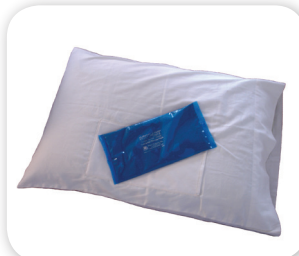
Soft Ice® Pillowcase

The Soft Ice® Pack naturally dissipates heat, producing comfortable cooling relief all night. Pack stays flexible when frozen for additional cold therapy.