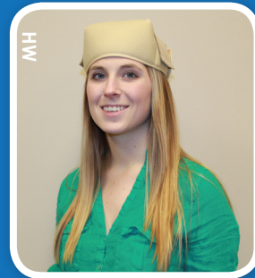
Soft Ice® Deluxe Full Coverage Head Wrap