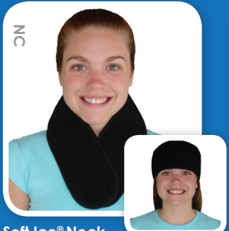
Soft Ice® Neck and Head Wrap