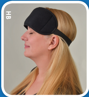
Soft Ice® Head Band