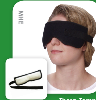
Thera-Temp® Eye and Sinus Wrap