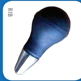
Roller Ice® Bullet