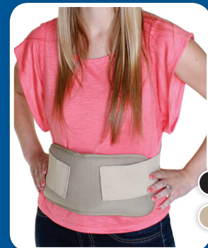
Secrets Torso Wrap