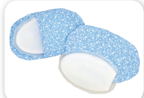
58° Bra Coolers