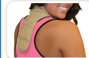
Neck & Spine Wrap