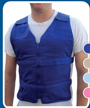
Zipper Front Vest

Discreet pockets can use either type of cooling pack, so you can choose the best option for your needs. You may want to order both: extra pack sets are available at a discounted price! Patent pending spinal pack placement allows for optimal cooling.