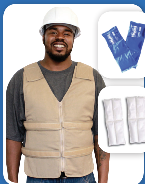
Industrial Vest Kit