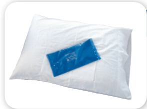
Soft Ice® Pillowcase

Naturally dissipates heat for comfortable cooling all night! Freeze the soft, flexible pack for additional cooling relief.