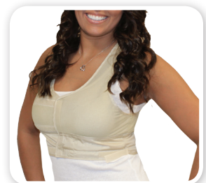
Performance Half Vest