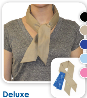
Deluxe Neck Tie