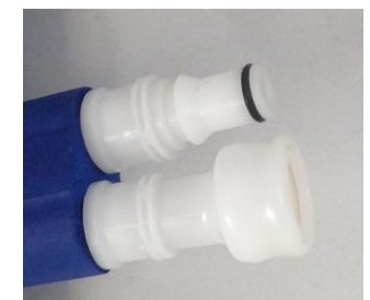
Male (top) & Female Breakaway Couplings

TROUBLESHOOTING TIP! A good way to isolate the problem is to remove the couplings from the insulated tubing attached to the reservoir. To do this, simply turn off the unit, pull off (or cut off) the couplings, place the end of the hoses over a sink and turn the system on. If water flows freely, the obstruction is in the couplings, tubing or bladder. Couplings can become blocked with minerals, hair etc. Use a paper clip to clear the blockage. A new coupling or bladder may be necessary. To reattach the couplings simply cut the tubing back to unused tubing and push the coupling back into the tube.