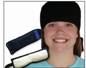
Migraine & Headache Pain Relief Kit

See our complete product line at polarproducts.com