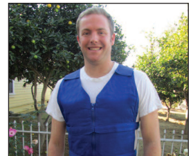
Body Cooling Garments