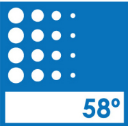
58 Degree Cooling