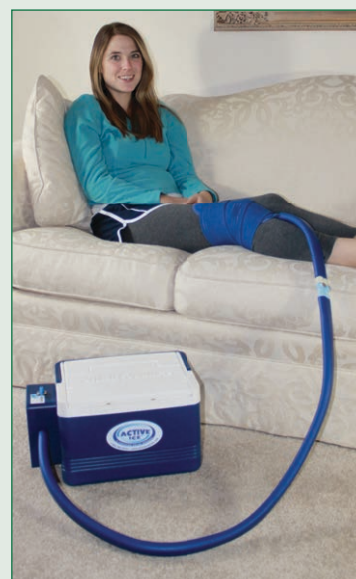
Active Ice® Cold Therapy System

Roller Ice® Trigger Point Massage Tools Convenient and comfortable. No mess!