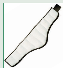
Thera Temp® Moist Heat