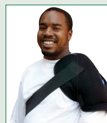
Soft Ice® Compression