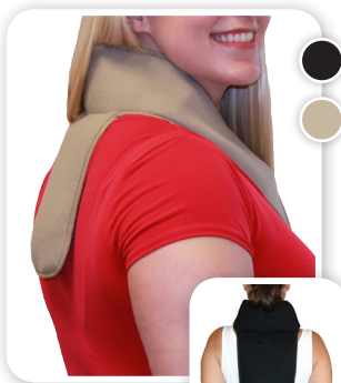
Neck and Upper Spine Wrap #NCEX Kool Max® $38.50 Cool58® $56