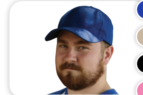
Baseball Cap #CCBC $16.75