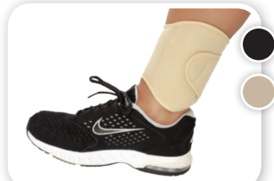
Ankle Wraps Kool Max® $41.00 (Pair) Cool58® $72.75 (Pair)