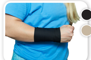
Wrist Wraps Kool Max® $33 (Pair) Cool58® $49.75 (Pair)