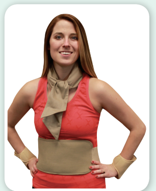
CoolFit® Kit #CFK $191.25