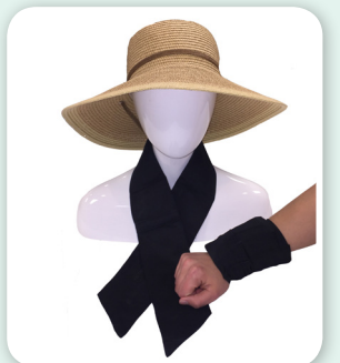
Accessory Kits With Kool Max® or Cool58® Packs See additional kits on-line!