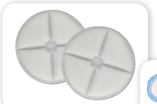
58° Bra Coolers #PCBC $37.50 (Pair) #PCBC Large $81.25 (Pair)