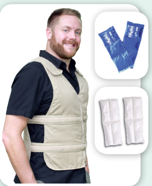
"Home & Away" Kits Include Kool Max® & Cool58® Packs