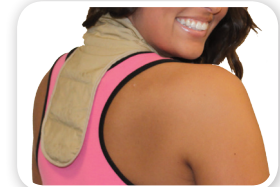
Neck & Spine Wrap #CCNBX $10.50