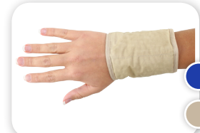
Wrist Wraps #CCW $8.99 (Pair)