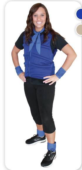
Sports Kit #CCSV $47.00

Lightweight, water-activated cooling is ideal for exercise and outdoor activity.