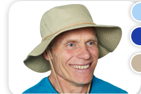
Bucket Hat #CCBH $16.75