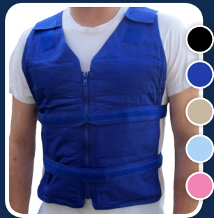
Zipper Front Vest

Discreet pockets can use either type of cooling pack, so you can choose the best option for your needs. You may want to order both: extra pack sets are available at a discounted price! Patent pending spinal pack placement allows for optimal cooling.