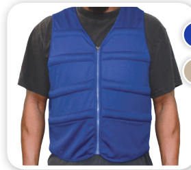
Sports Vest #CCSV $47.00