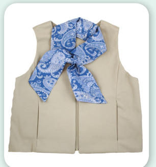
Fashion Kit Women's $199.75 - $291.25 Men's $237.25 - $321.25