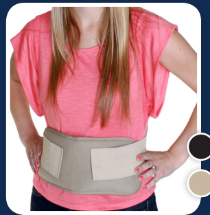
Secrets Torso Wrap

Kool Max® $143.25 - $166.75 Cool58® $175.75 - $218.75