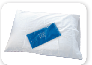
Cooling Pillowcase #SIPC $27.00