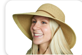
Straw Hat #CCSH $18.25