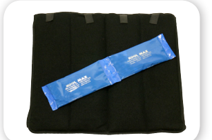
Seat Cushion #KMSP $56.75