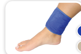
Ankle Wraps #CCA $13.00 (Pair)