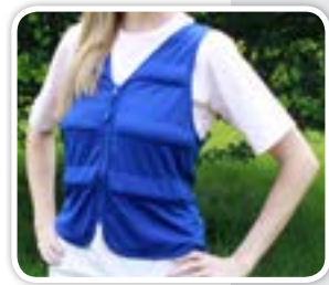
COOL COMFORT® HYBRID

"This Kool Max® vest has really opened opportunities for me to be active and have fun in the summertime. This summer has been extremely hot (many 90°+ Fahrenheit days), but I've gone canoeing, kayaking, gardened, archery/range, BBQs, etc. with NO heat fatigue, yay! Some people are curious when I wear the vest and I tell them it keeps me cool and comfy!"