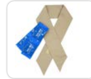
KOOL MAX® NECK WRAP