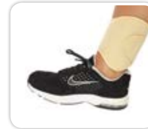
KOOL MAX® ANKLE WRAPS