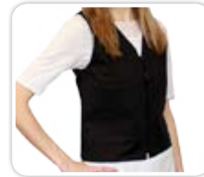
WOMEN'S FASHION VEST

Read what people with MS say about their quality of life with a cooling vest!