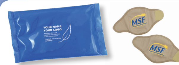
SOFT ICE® HOT/COLD THERAPY PACK & KOOL MAX® ANKLE WRAPS

Thank you to our loyal customers, colleagues and friends in the international MS community!