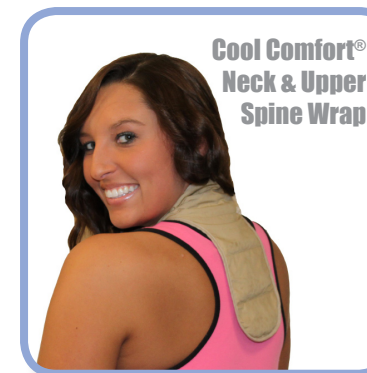
Cool Comfort® Neck & Upper Spine Wrap

We welcome your feedback! Please e-mail polar@polarproducts.com with your suggestions and ideas for new products.