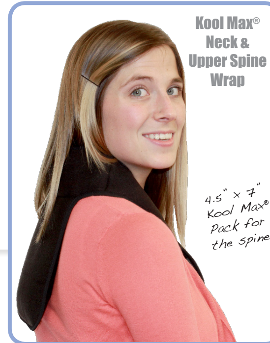
Kool Max® Neck & Upper Spine Wrap

Strategic cooling placement is an effective way to reduce the overall weight of cooling vests and accessories.