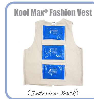
Kool Max® Fashion Vest