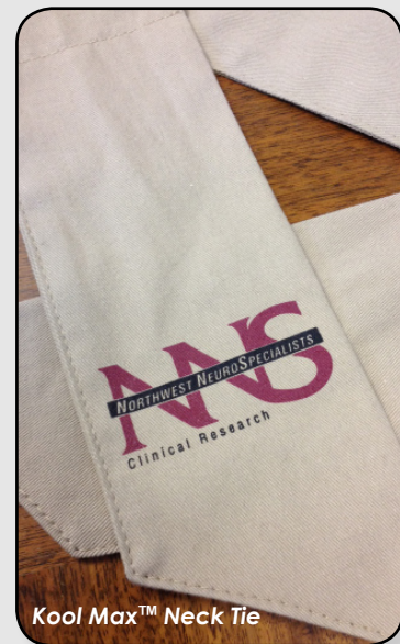
Kool Max™ Neck Tie

We welcome your feedback! Please e-mail polar@polarproducts.com with your suggestions and ideas for new products.