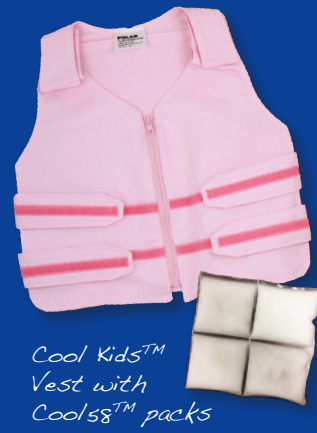
Cool Kids™ Vest with CoolS8™ packs

Heat intolerance is a symptom that children with MS may experience. As someone diagnosed with MS myself as an adult, it saddens me that heat sensitivity can be life altering for an active child. With the right body cooling products, kids with MS don't have to miss out on the fun!