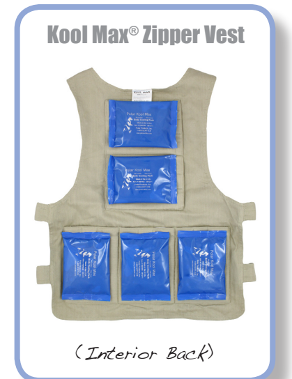
Kool Max® Zipper Vest