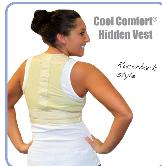
Cool Comfort® Hidden Vest