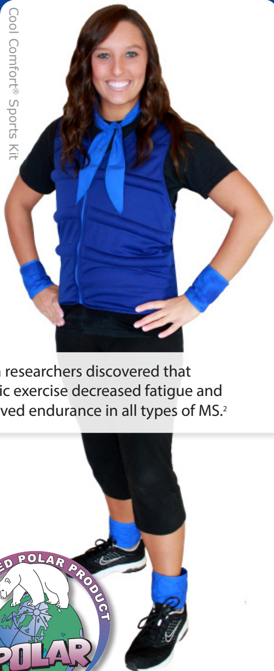
Cool Comfort® Sports Kit

Italian researchers discovered that aerobic exercise decreased fatigue and improved endurance in all types of MS. 2