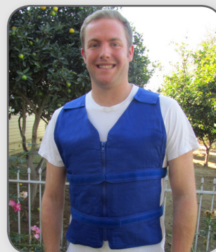
Shown above: The #1 choice for MS cooling, our Kool Max Zipper Front Vest.

Would you like free samples to demonstrate at your clinic?