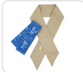
KOOL MAX® NECK WRAP