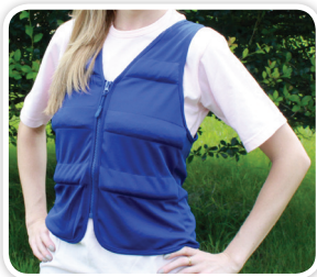
COOL COMFORT® HYBRID

For more information: Call MSF at 1.888.MSFOCUS (673.6287) or visit www.msfocus.org/Cooling-Program.aspx