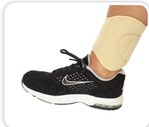
KOOL MAX® ANKLE WRAPS