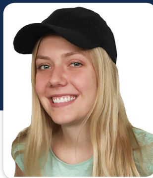
BASEBALL CAP WITH PHASE CHANGE INSERT

Bra coolers now available with full cooling coverage! Can be easily inserted into bra or just placed on the breast or chest for therapy. Cools at a comfortable 58 degrees F.