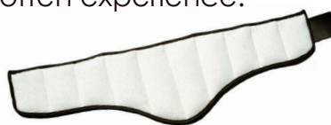
THERA-TEMP® MOIST HEAT CERVICAL WRAP