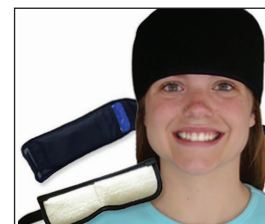
Migraine & Headache Pain Relief Kit

See our complete product line at polarproducts.com