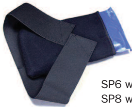
SP6 w/ 6" x 9" pack SP8 w/ 8" x 9" pack