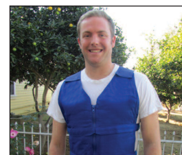
Body Cooling Garments