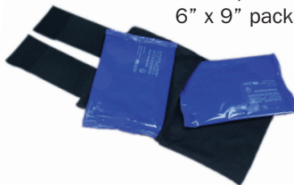
UVM w/ two (2) 6" x 9" packs