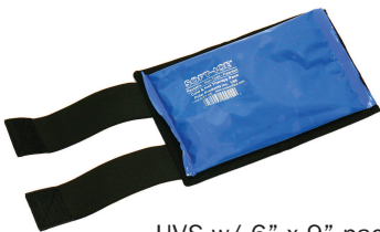
UVS w/ 6" x 9" pack