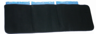
UV3M w/ three (3) 6" x 9" packs UV3L w/ three (3) 8" x 9" packs