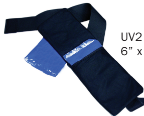
UV2 w/ two (2) 6" x 9" packs