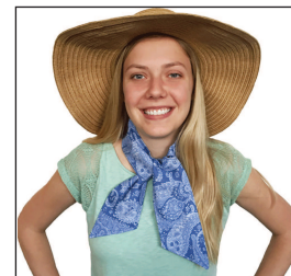
Cooling Fashion Scarves and Hats