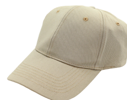
Cool Comfort® Hats

See our complete product line at polarproducts.com