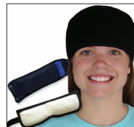
Migraine and Headache Pain Relief Kit