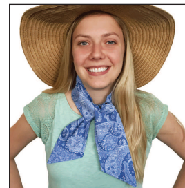
Fashion Cooling Scarves