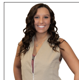
Fashion Cooling Vests

See our complete product line at polarproducts.com